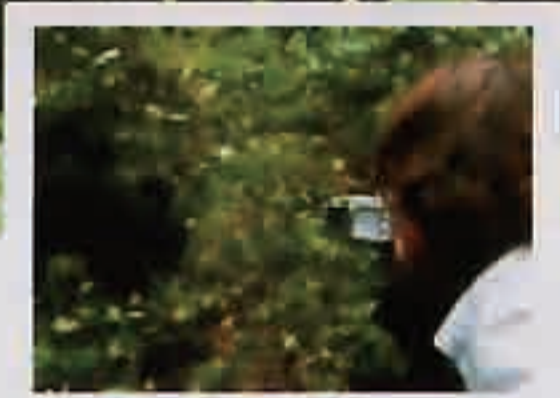
EVERREYS CAN ENJOY WATCHING THE gorillas and the amusing antics of their young

It is a privilege to spend an hour watching the gorillas as they go about their daily routine, feeding, playing and resting - as you question your primeval existence and relive the wonder that kept Dian Fossey living in the forest for almost 18 years. Her grave site, a two hour trek, is a memorial to her study of the gorillas and their resultant preservation. The gorillas habitat, in the mountainous north, is the string of magnificent Virunga peaks that range from 2 500 to